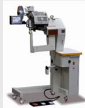
Bonding Technology 336.61