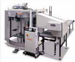
Automatic Four Station Unit 320